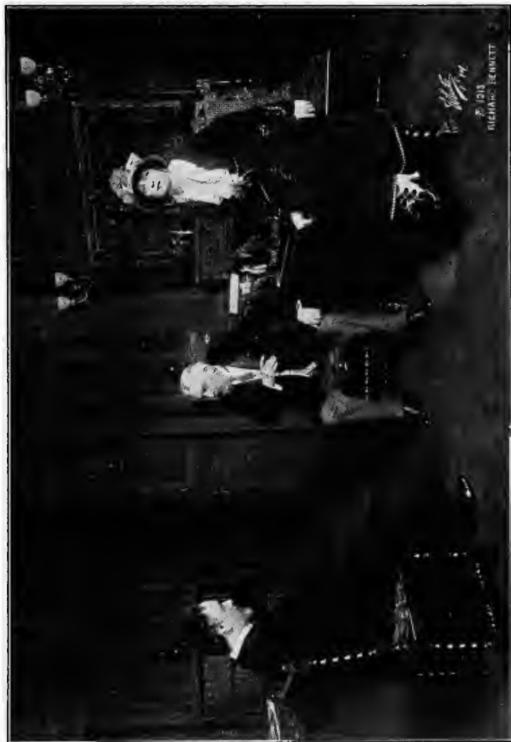
THE GIRL OF THE STREETS TELLS HER STORY